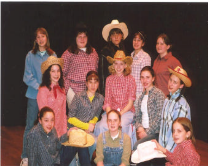
Chorus from "45 Minutes from Broadway"

Congratulations to the 6th graders for producing outstanding pieces of work!!